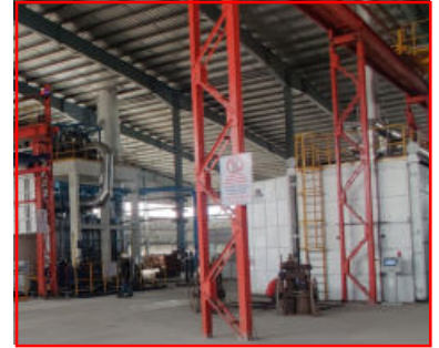
CCR KILN & DRYER