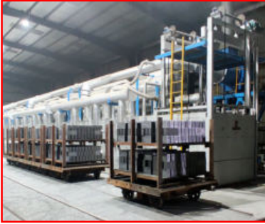
UNBURNT BASIC TEMPERING KILN

Factory : Balban, Palpara, Baruipur 700 144, 24 Parganas (S), WEST BENGAL