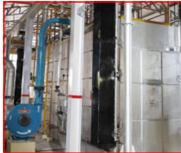
PCPF LANCE DRYER