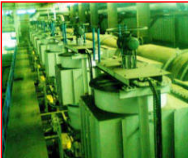
GRAPHITE ELECTRODE REBAQUE TUNNEL KILN