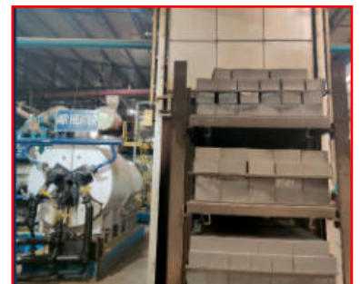
BASIC TEMPERING KILN