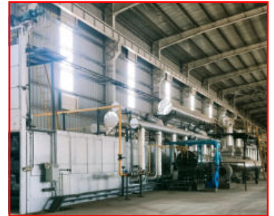
UNBURNT BASIC TEMPERING KILN