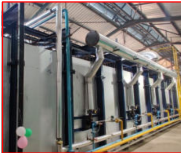
HIGH TEMPERATURE TUNNEL KILN