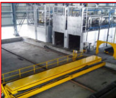
GRAPHITE PREHEATING FURNACE