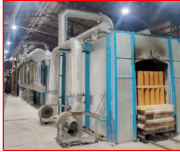
HIGH ALUMINA TUNNEL KILN