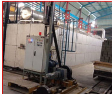
HIGH ALUMINA TUNNEL DRYER