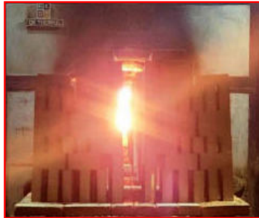
BASIC TUNNEL KILN