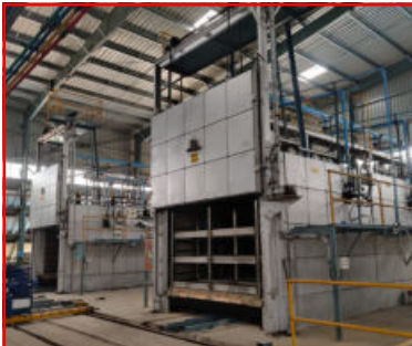
PCPF PRECAST FURNACE